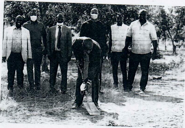
Plate 1. Sod cutting by the Vice Chancellor at the Site Possession Meeting

A site possession meeting was held on December 3, 2020 to handover site to the contractors for work to start. The contractors had Sixteen (16) calendar months to execute the works and handover same to the client for use.