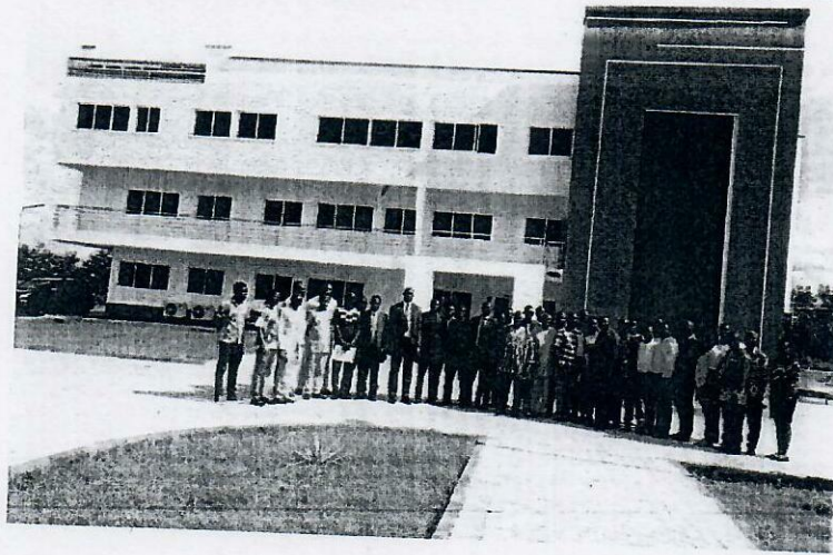
Plate 3. At an Interim handover meeting